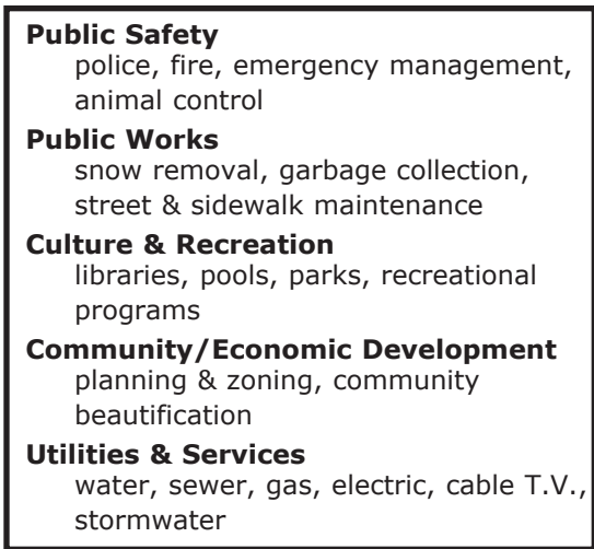
Figure 2: Cities are responsible for a variety of functions.